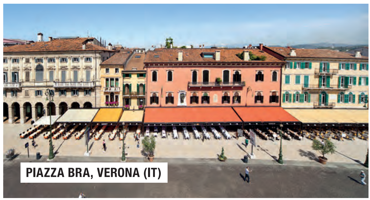
Large-area sun and weather protection solutions harmoniously matched to the architecture.

Products perfectly matched to the requirements of the gastronomy industry.